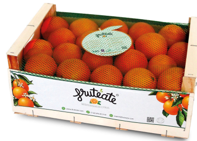
Dutch format 10 kg