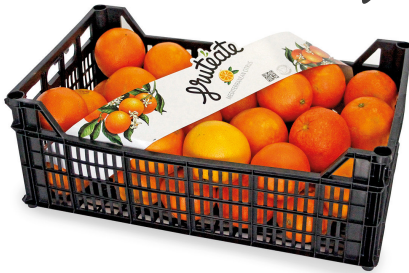
Planchette 10 kg