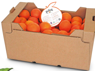
Kraft 15 kg